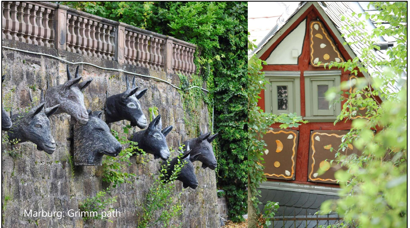
Marburg: Grimm path

The "Grimm path" with its art installations referring to famous fairytales still leads through Marburg old town.