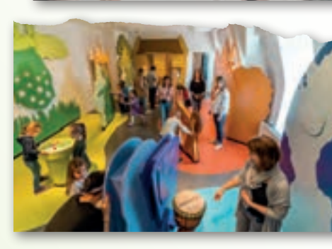
GRIMMWELT Kassel (top); Brüder Grimm-Haus in Steinau (middle); GrimmsMärchenReich in Hanau (bottom)