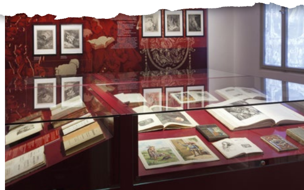
Brother Grimm House, Steinau